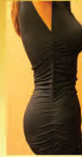
Liposuction abdomen with hourglass