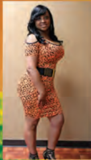
Breast augmentation & butt lift